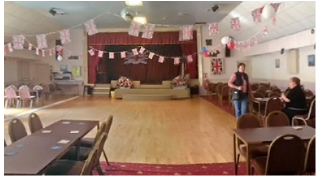
Part of the Highcliffe Sports and Social Club Hall - our new Exhibition Venue