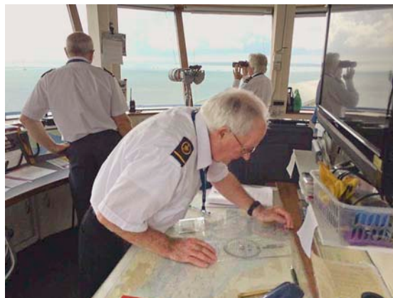
Your editor plots his future course!

As David mentioned, I have decided to relinquish the task of compiling the Scale Section Newsletter! The first Newsletter that I edited was for Winter 2008 - you can view it, and all the succeeding Newsletters, on the Club web site ( http://srcmbc.org.uk/recent-scale-section-newsletters/ ). Back in 2008, the use of email and the internet was much less than today and a good proportion of the Newsletters were sent out by post. For most Club Members the Newsletter was the main means of receiving information and news from the Club. I realise that for some Club Members that still remains the case, and I hope that the Committee will find a way to ensure that it continues, possibly in a shorter format. However times have changed, and the large majority of Scale Section members now receive the newsletter by email. For those members, email and the Club web site provide an easier and quicker means of communication, rather than a formal Newsletter.