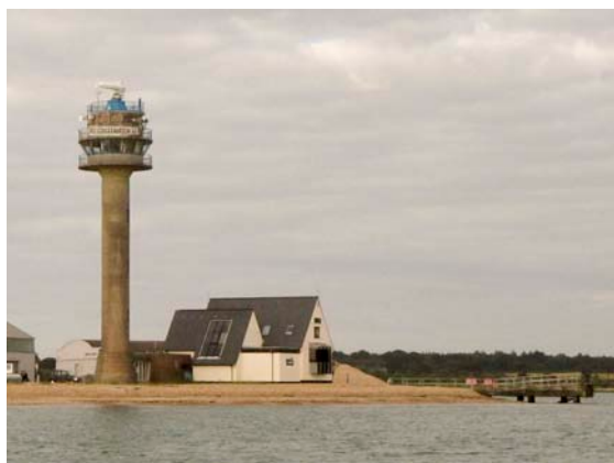
Calshot Tower and the adjoining RNLI Station

In editing the Newsletter I have tried to include one or two articles each month which might be of more general interest to members. However getting contributions has recently proved difficult, partly because I am less often at the pond to either bully or plead with potential authors. Unfortunately a similar situation applies to the new Club web site. Results of the weekly International One Metre races are now being regularly posted by the Sailing Section but contributions from the Scale Section are few and far between. If you have built a new model and taken photos, or have new photos of your models at the pond, send them to me and they will go onto the web site. Alternatively you can put photos or news items on the web site yourself - it's not difficult. At the Highcliffe Exhibition I'm hoping to be able to offer tutorials on how to post on the web site, and I'll also have new crib sheets available in the format which has proved helpful for the Sailing Section.